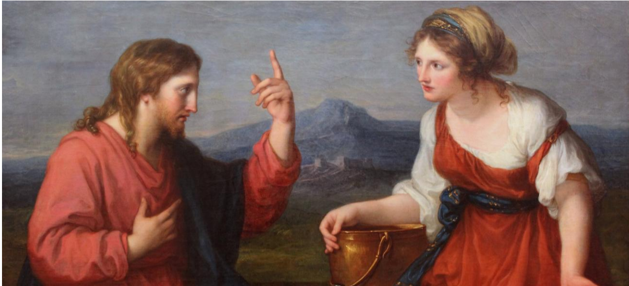
The Water of Life Discourse between Jesus and the Samaritan Woman at the Well by Angelika Kauffmann , 17–18th century